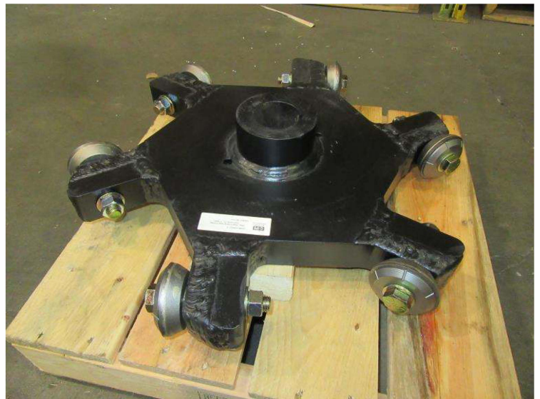
Round Adzer Bits installed on a 19", 6-arm Adzer Cutting Head with a 2" Taper (Part# ADKK19-2)

Description: Round Adzer bits with carbide cutting inserts for reliable rail tie adzing. Designed to accept: a standard 3/4" diameter bolt. 3-1/4" outside diameter and capable of being fitted in either fixed or rotating configurations.