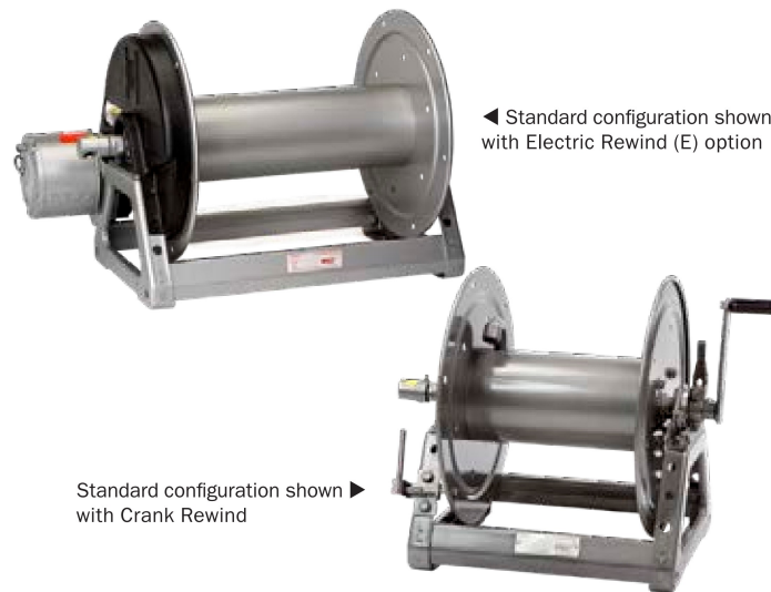
◀ Standard configuration shown with Electric Rewind (E) option