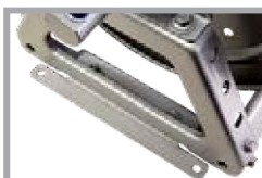
Standard configuration shown ▶ with Crank Rewind