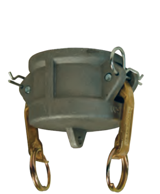
A380 permanent mold aluminum