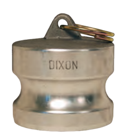
A380 permanent mold aluminum