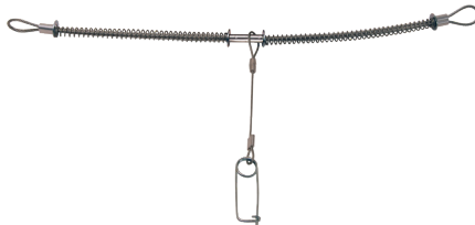
WB1C - WB1 with safety clip and lanyard