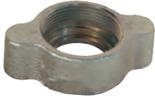
Plated iron / steel